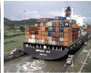
The lock raises the ship.